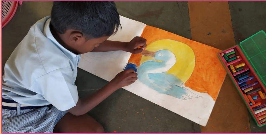
Sutharsan - UKG